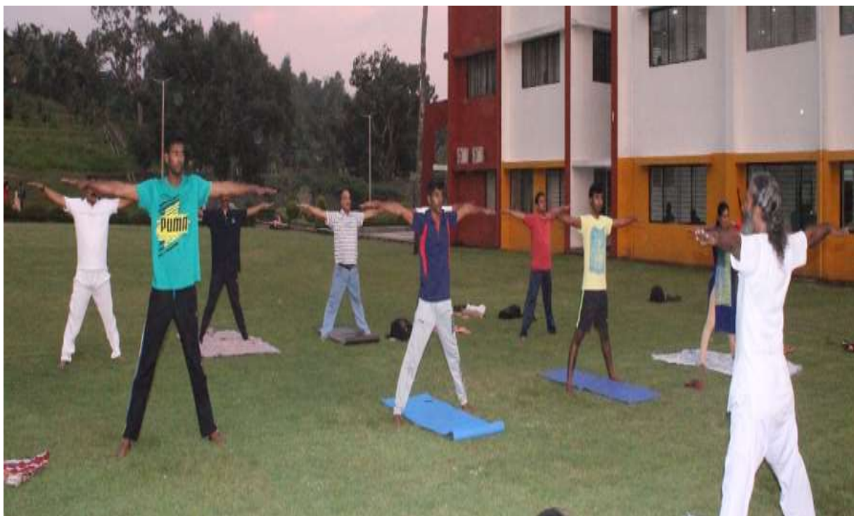
Fig.6. Glimpses of Regular Yoga classes being held at the MITE campus