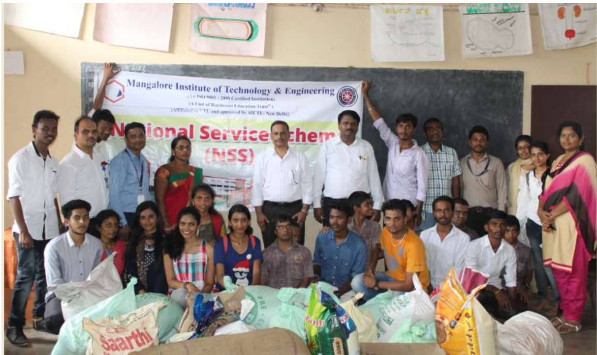
Fig.2. Visit to Vijetha Special School, Karkala on 15 th August 2017