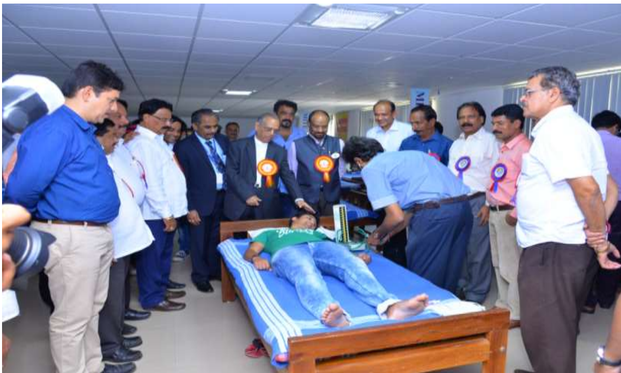
Fig.5. Mega blood donation camp on 10th February 2018