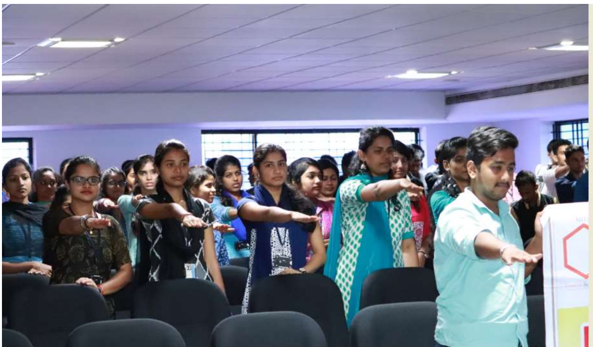
Fig.1. Sadbhavana Day Pledge at MITE Campus on 19th August 2017