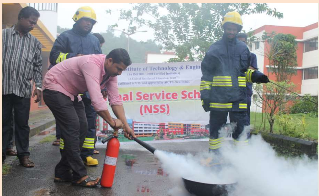
Fig.3. Fire fighting demonstration Program on 13 th October 2017