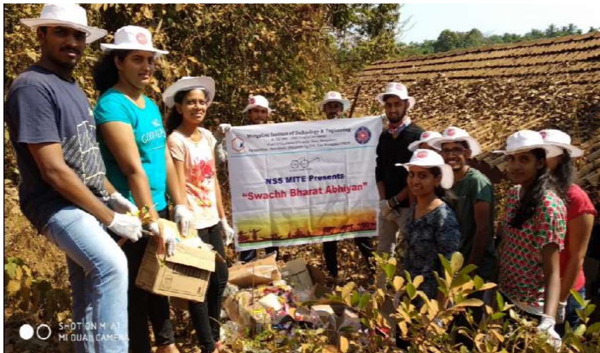
Fig.4. Swachh Bharath Abhiyan at Primary health centre, Karkala on 19 th January 2018