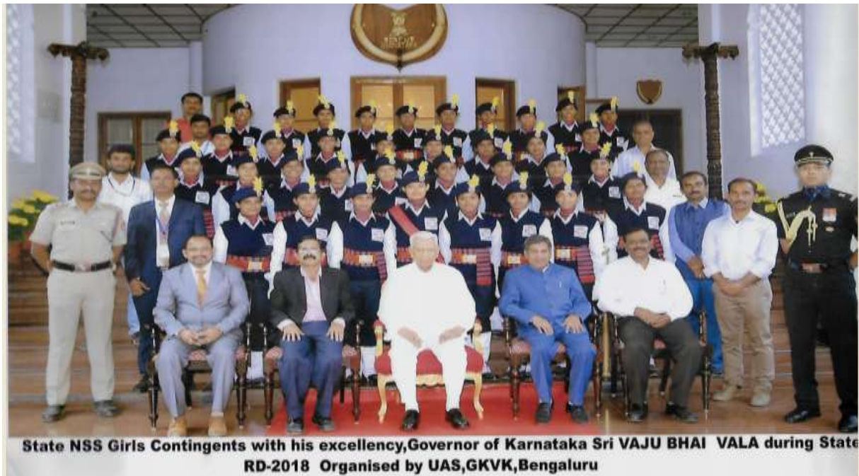
State NSS Girls Contingents with his excellency, Governor of Karnataka Sri VAJU BHAI VALA during State RD-2018 Organised by UAS, GKV, Bengaluru