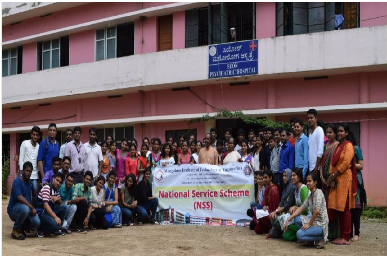
Members of MITE family at Seon Ahram