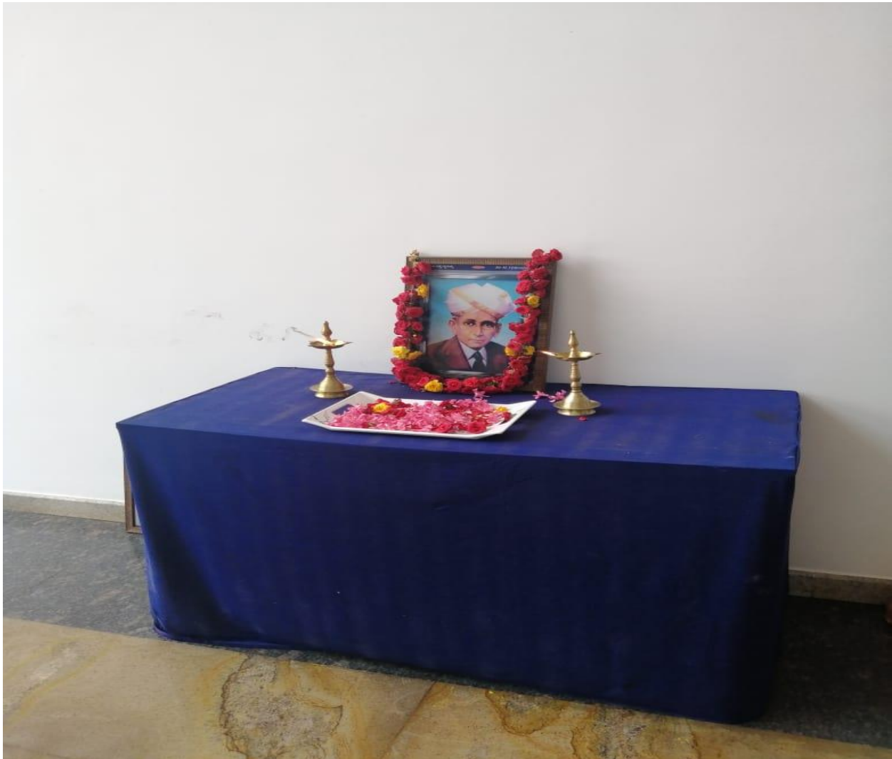
Sir Visveswaraya paid respects on Engineers' day

On 15.09.2015 Engineers' day was celebrated by the faculty and students of MITE. The program started with welcome address by the Vice Principal followed by a talk by the Principal on the occasion. He highlighted the great contributions of Sir M Visvesvaraya to the Nation and how his life is worth emulating. Faculty and staff of MITE offered flowers to the photo of Sir Visvesvaraya and paid their respects to him.