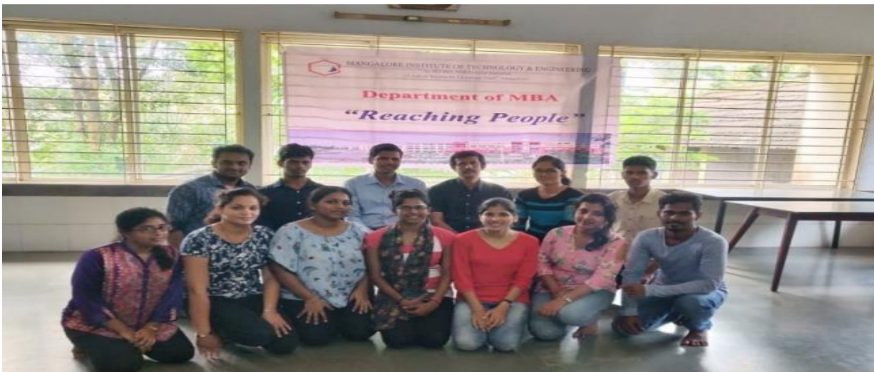
CSR volunteers at Infant Mary orphanage, Kulshekar