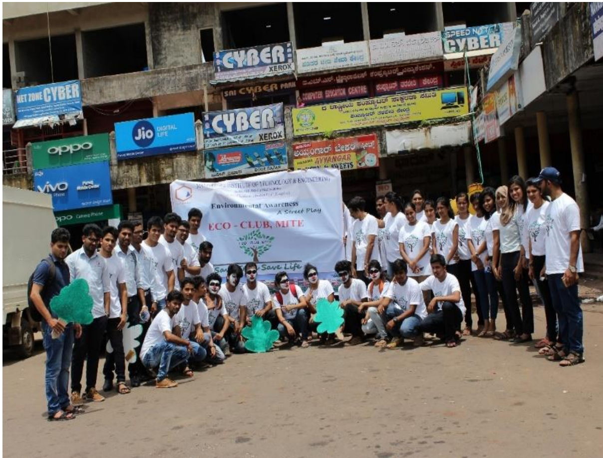
Eco club volunteers after the street play