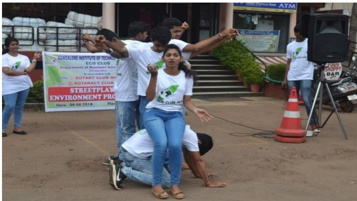
Street play in progress at Moodbidri