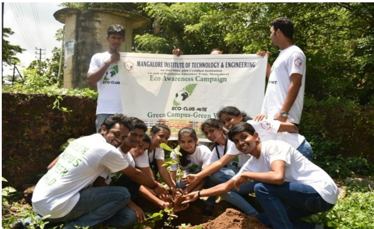
Eco Club members planting saplings at Masthikatte

All the Club members donned the newly designed ECO Club T-shirt with the new logo and the slogan “GREEN CAMPUS, GREEN WORLD” which went a long way in boosting the enthusiasm of the students and the public.