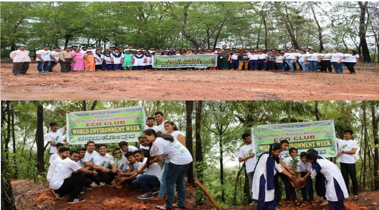
Eco Club members celebrating Vana Mahotsava at Adarsha High School, Taccode