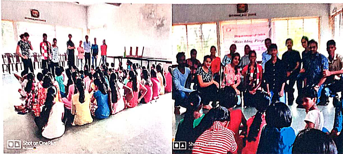
Volunteers interacting with inmates of Infant Mary orphanage