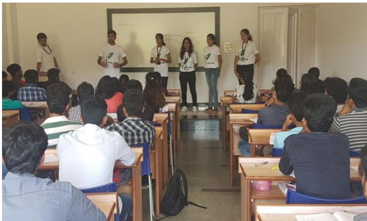
Eco Club volunteers doing green environment campaign

The program was well appreciated by all in the campus.