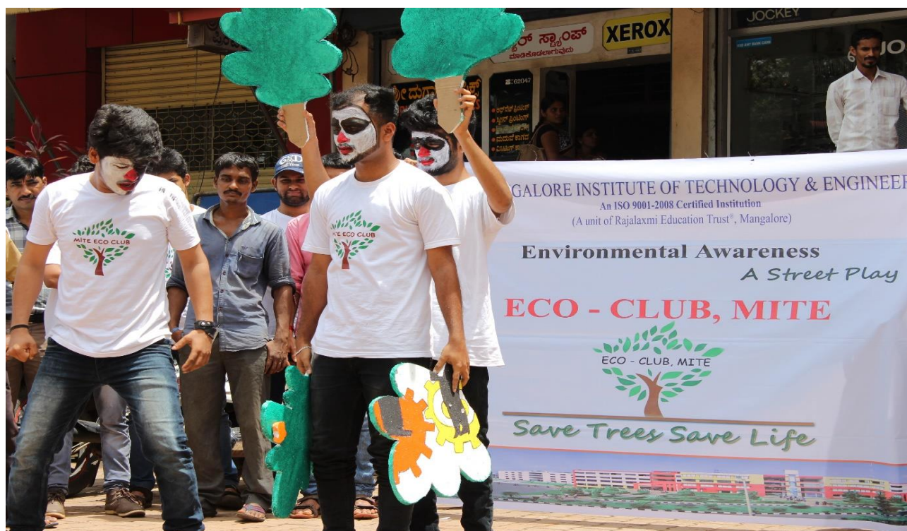
Street play in progress