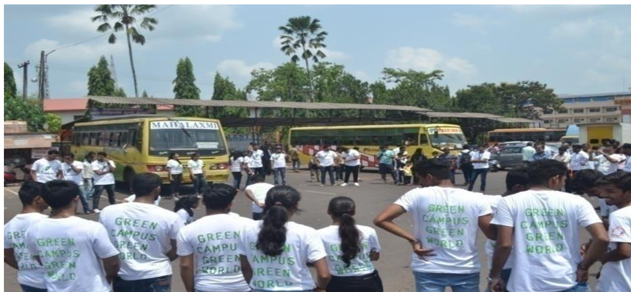
Street play inside Moodbidri bus stand