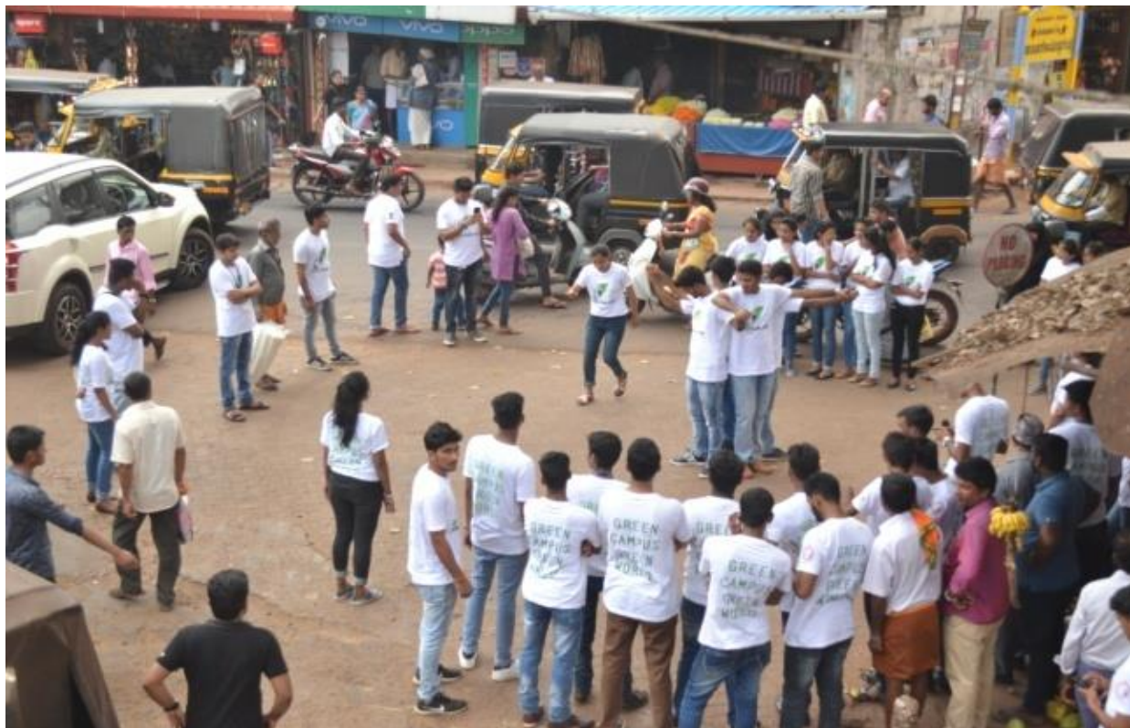
Volunteers performing street play on pollution near market place