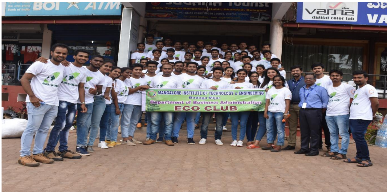
Eco club volunteers at the venue for the street play

The show was conducted with an objective of creating awareness towards environment protection, saving of trees, conserving water, managing organic and inorganic wastes, etc. The play was conceived, written directed and enacted by the volunteers of the Club.