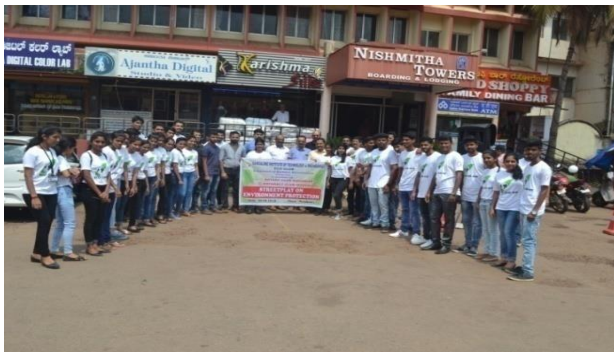
The street play team in front of Nishmitha Towers