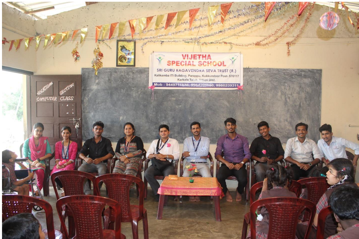
CSR committee members with faculty co-ordinator at Vijetha Special School, Karkala

CSR Club members from MITE MBA celebrated Deepavali-2018 with the specially-abled children from Vijetha School, Karkala in a unique way. Vijetha School, Karkala is a well-known school that takes care of specially-abled children and works towards making them independent. The school inmates prepare crafts and candles and sell them in and around Karkala town.