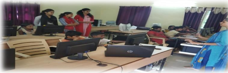
Session in progress