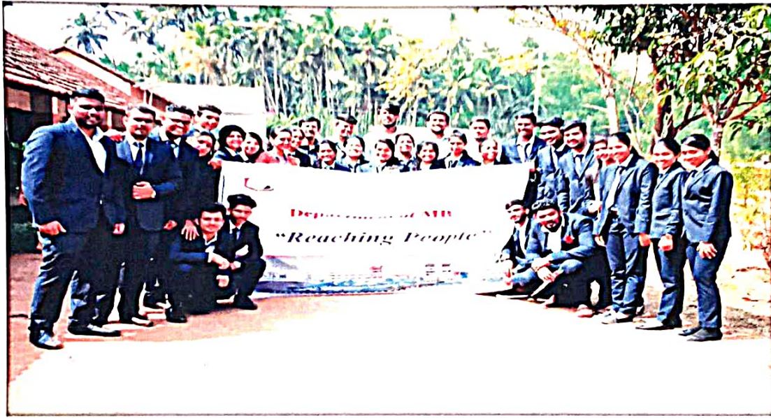
CSR club members after the workshop at government school Ajekar