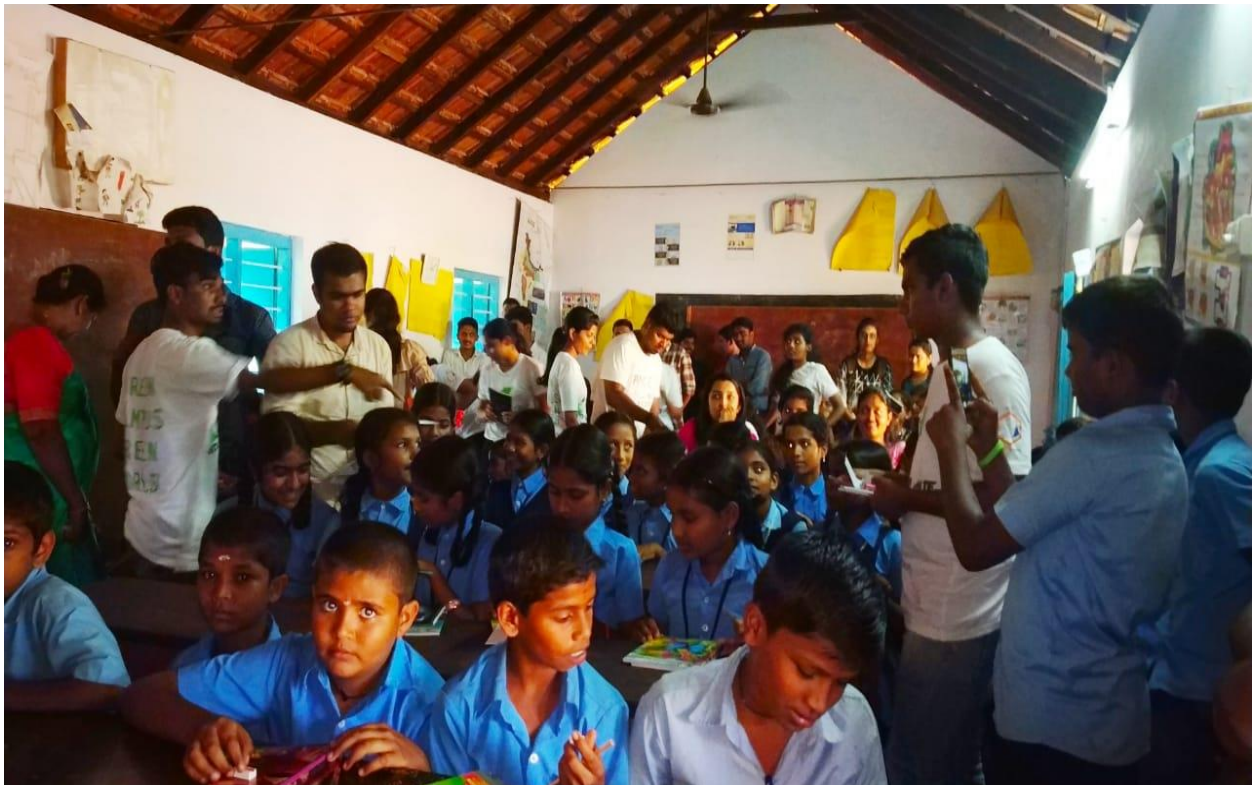
Session on recycling in progress at Government school Paladka

ECO Club members of MITE MBA visited Government primary school, Kadandale, Paladka on 5th November, 2018. The ECO Club distributed stationery items to the poor and needy children of the school purchased from the money they generated by recycling waste. Club members spoke about recycling of papers and the need for saving trees for future. They were briefed about the exercise of recycling undertaken by the ECO Club - How waste was collected from the college, sold for recycling and stationeries bought for them from the money generated. This simple exercise made very convincing and lasting impression in the young minds of school children about waste recycling. Many students appreciated the act and promised to engage in careful collection and recycling of 'Raddi' waste in their houses. ECO Club conducts various such programs on ecological issues and on spreading awareness clean and green environment.