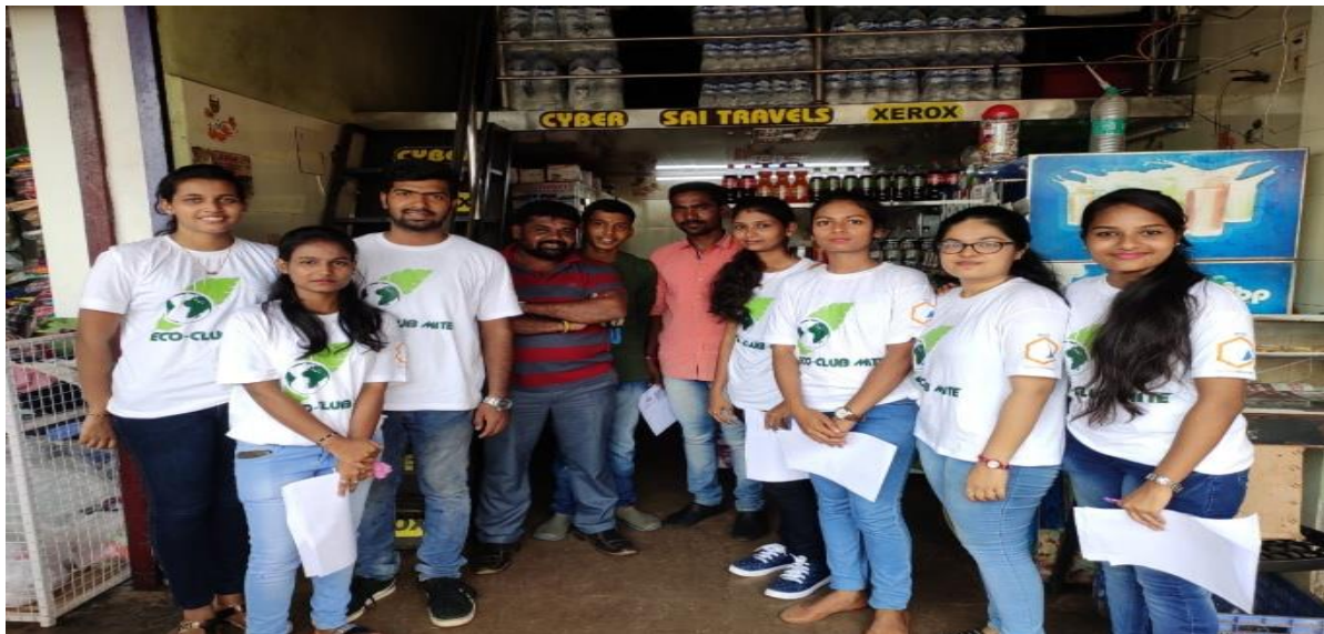
Shop to Shop campaign on water conservation by Eco Club volunteers