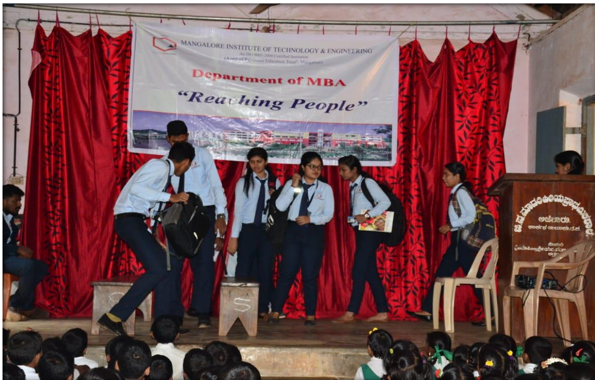
Skit performed by CSR volunteers at Government school Ajekar