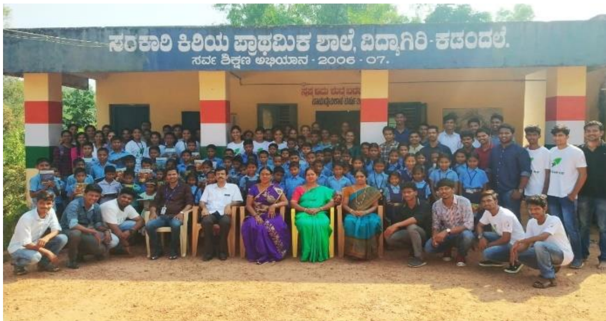
Eco Club volunteers at Government school kadandale

Accordingly members of ECO Club started collecting used and unused papers from the students. The club members spread awareness among student community in the campus about proper utilization of used and unused papers from their note books and their households. The Club members collected all 'waste papers' from the students and sold them to a book mart and purchased new books using that revenue. This unique initiative received favorable response from students of MBA. A total of Rs 2,500 was generated as a result of this exercise which was used to donate stationery items to the students of the Government lower primary school, Kadandale, Paladka.