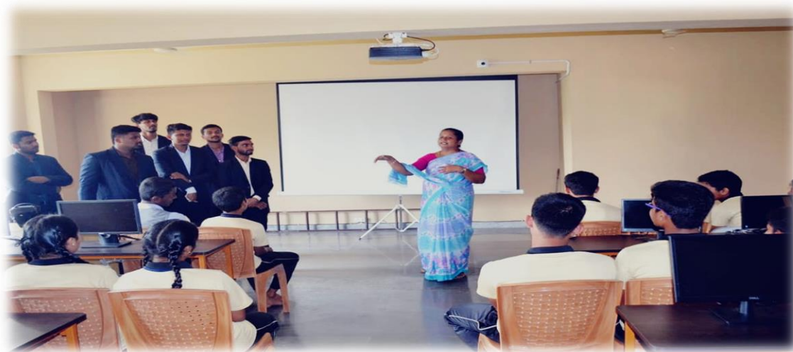
HM of St Ignatius School addressing the students