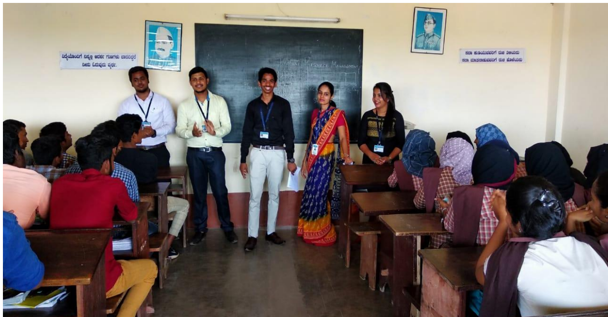
HR club members taking session at Guideline Tutorial, Surathkal

Since ETIMMITES believe in giving back to the society, the knowledge acquired and learnt in the past one year. This programme was held with the motive to act as catalysts and make lives better for the ones who are deprived. The team visited Guideline Tutorial, Surathkal and delivered a lecture on the Scope of MBA Globally and Relevance of HR in Corporate World.