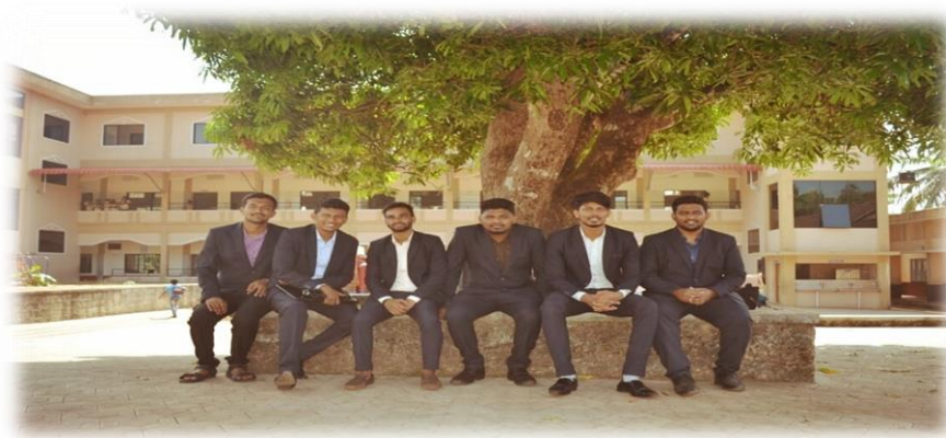
Eco Club volunteers at St Ignatius School, Paladka