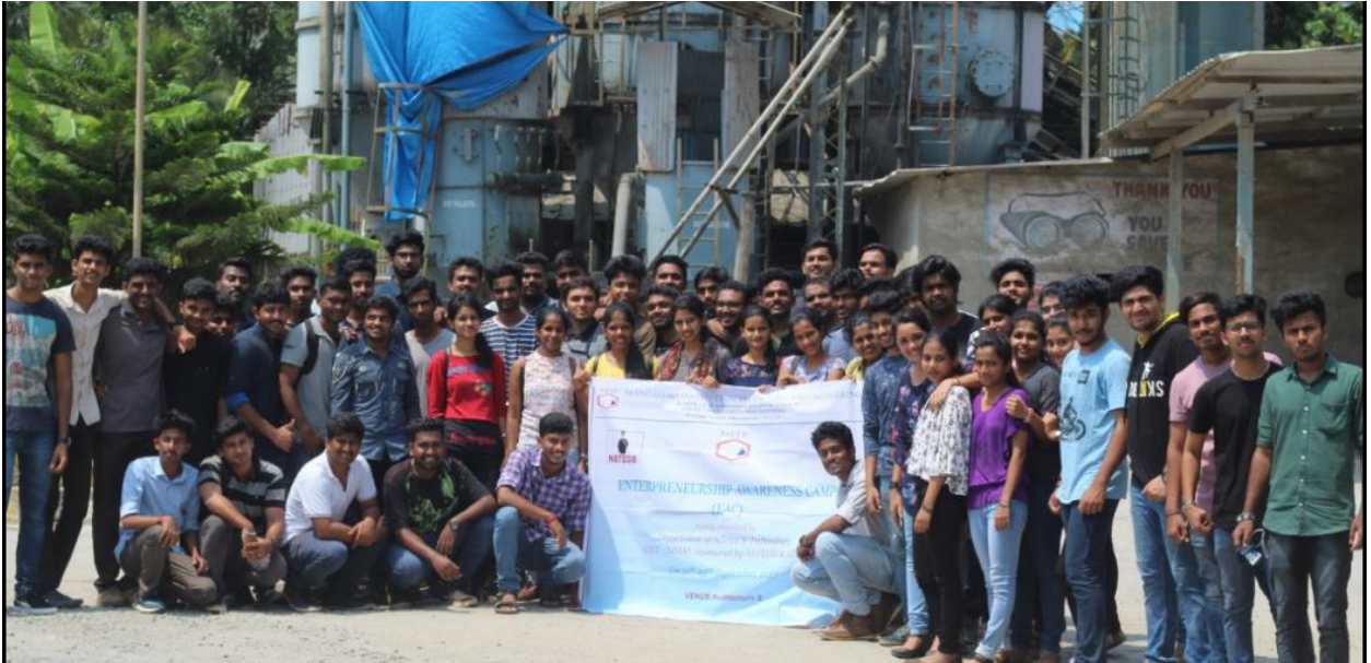
Group photo clicked @ industry