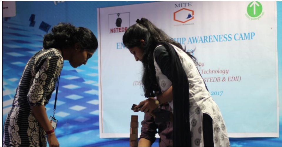
Gaming activity by participants