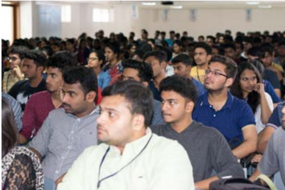
Participants for the session on Hackathon