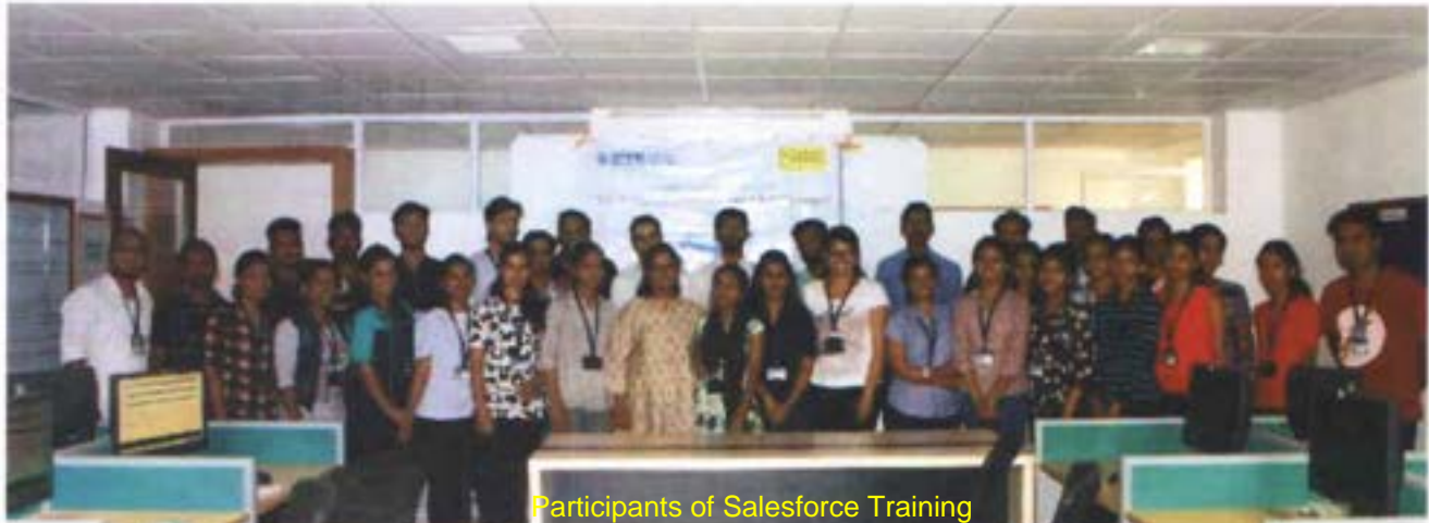
Participants of Salesforce Training

Two Days Workshop on 'Salesforce & CRM Concepts' Feb 9 th – 10 th 2018