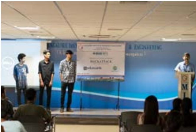
Inauguration of Hackathon

A Day long Mega Hackathon- HACKATTACK was conducted at MITE in association with Hackerearth and Pace Wisdom Solutions. The Hackathon was conducted on the Hackerearth Platform. A total of 87 teams with 247 Students participated in the event. The topics were announced on the morning of the event, and teams were shortlisted based on the design proposal submitted. Further only 50 teams were allowed to participate in the coding stage. The evaluation of the teams was done by the Team from Pace Wisdom Solutions company. Winning Candidates were given merchandise from Hackerearth. Also selected few candidates were given a Job opportunity and Internship opportunity by Pace Wisdom Solutions.