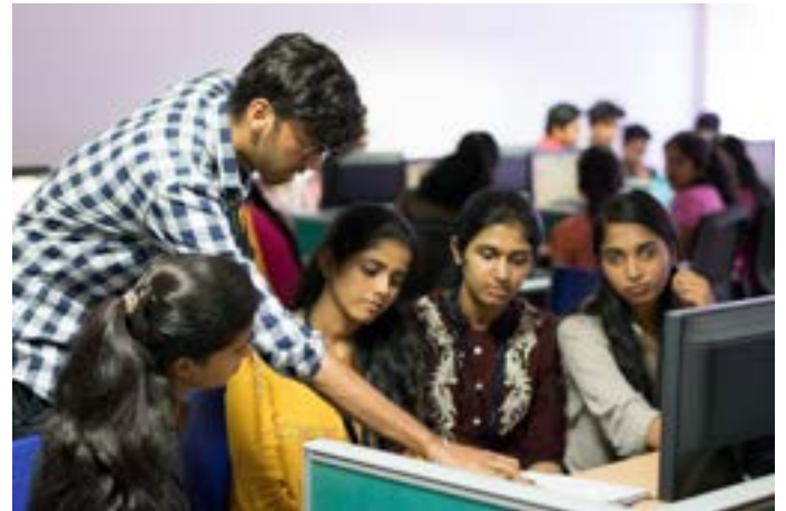
Mentors Guiding the Participants