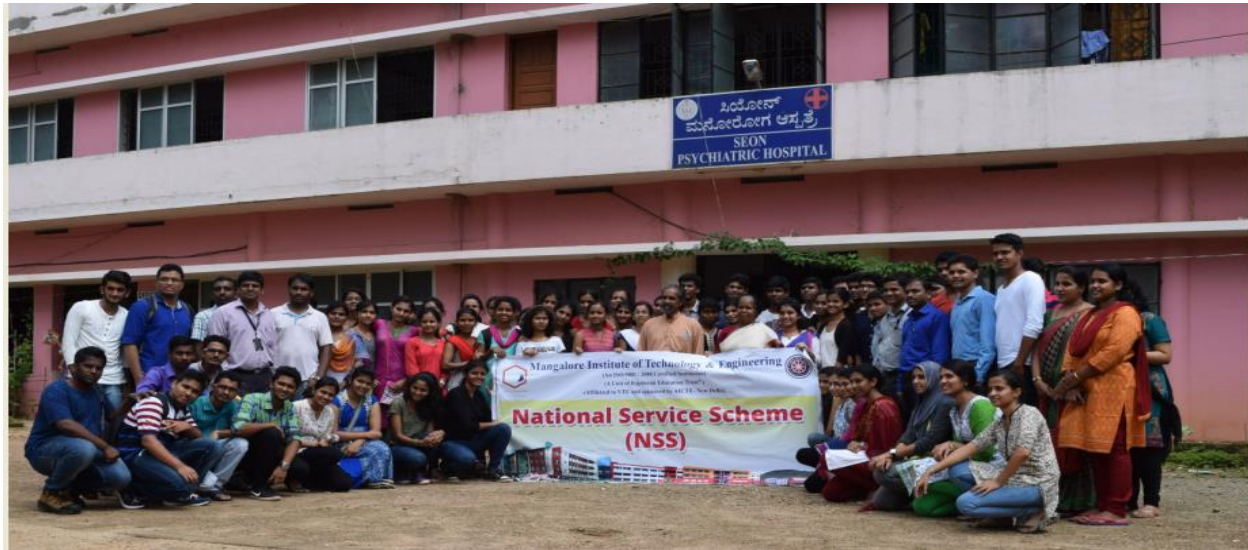
NSS and YRC volunteers at Seon Ashram.

A group of Red Cross and NSS volunteers from MITE along with a few staff members and Management visited the Ashram and spend quality time with the inmates. MITE donated a sum of Rs. 94,560 to the Seon Trust for them to provide food, medicine and other basic needs.