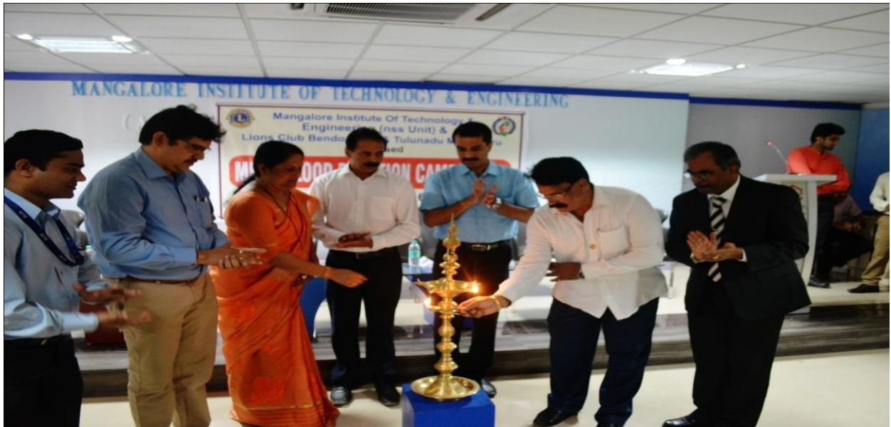
Inauguration of blood donation camp