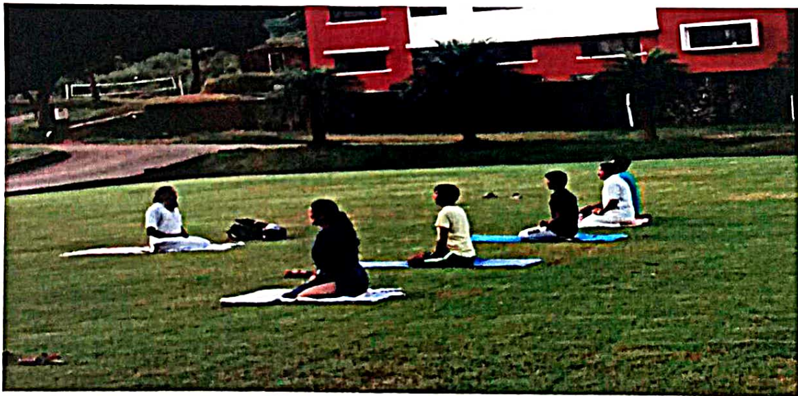
Yoga Session in Progress