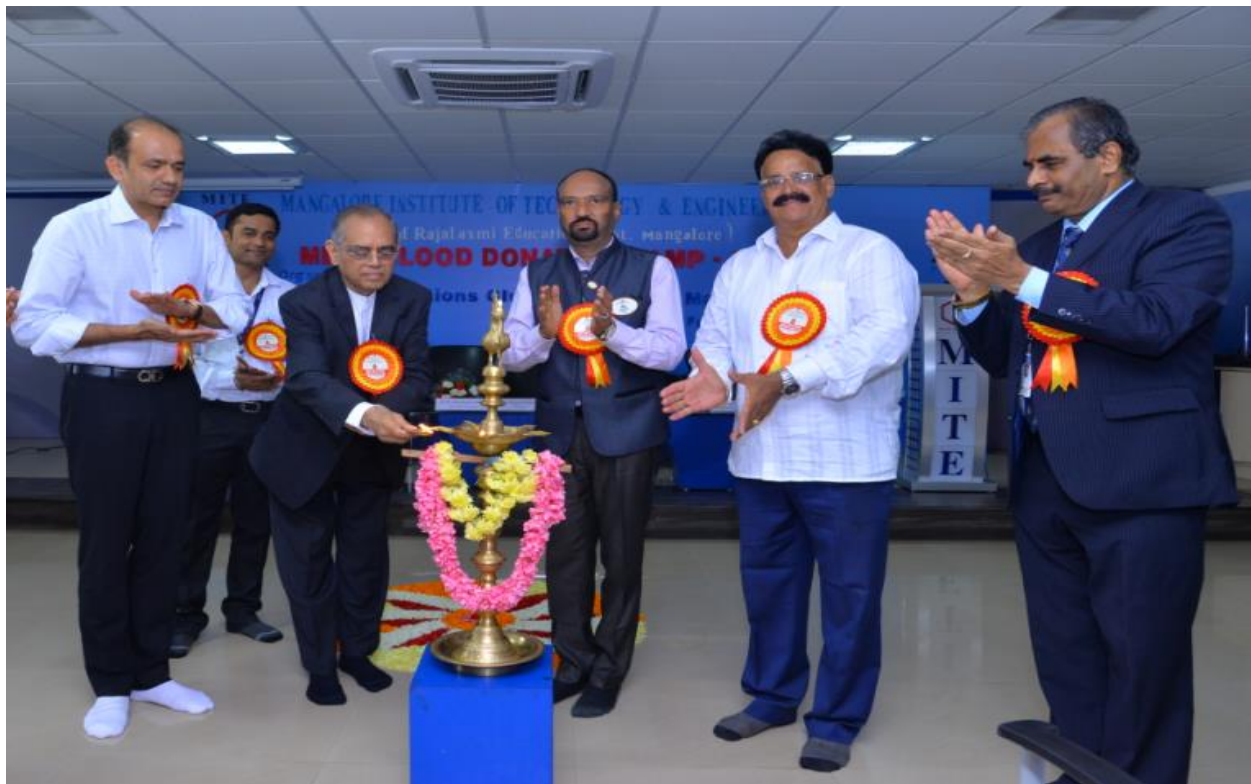
Inauguration of Blood Donation Camp