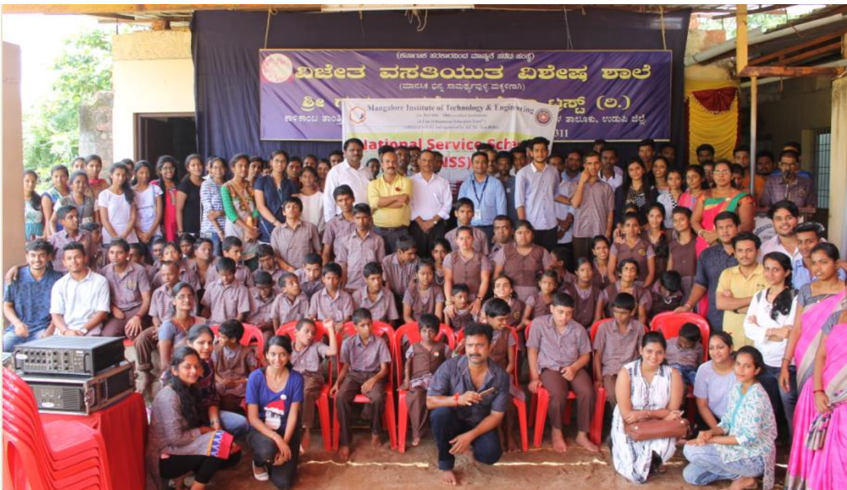
MITE Volunteers at Vijetha Special School

MITE fraternity donated groceries worth Rs. 44,110 and four Storage cupboards costing Rs. 27200 to the special school for the benefit of children.