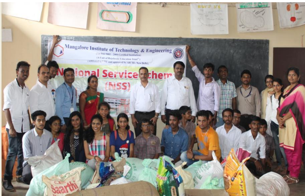
MITE Volunteers with Gifts

A cultural programme was also organized by the students of MITE entertain the inmates of the Vijetha Special School. The program left everyone with a sense of compassion and a feeling belongingness to the society.