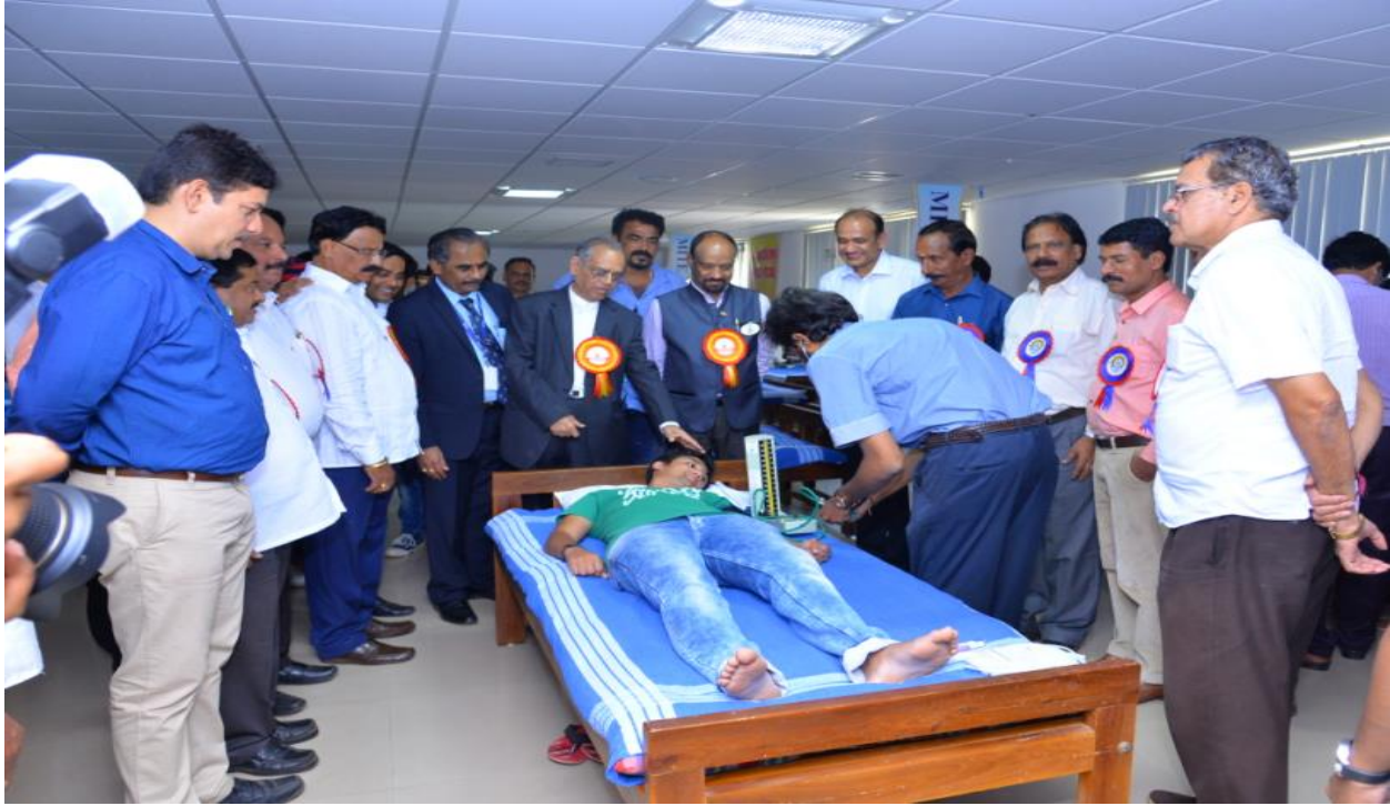
Blood Donation Camp in Progress