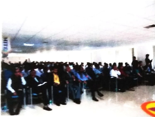
Delegates gathered from various organization in the International Conference