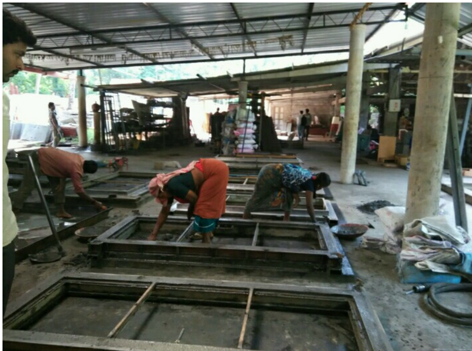
Master Plannery, Puttur, Industrial visit was arranged for second year students