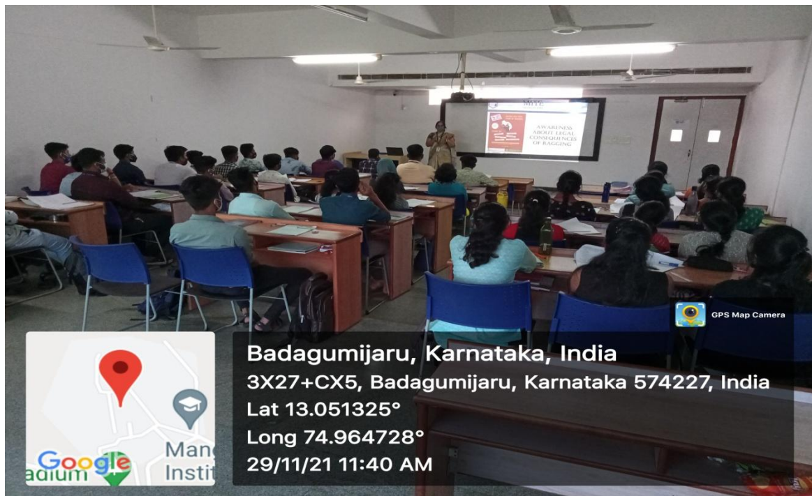
Presentation on Awareness of Consequences of Ragging For Senior Students