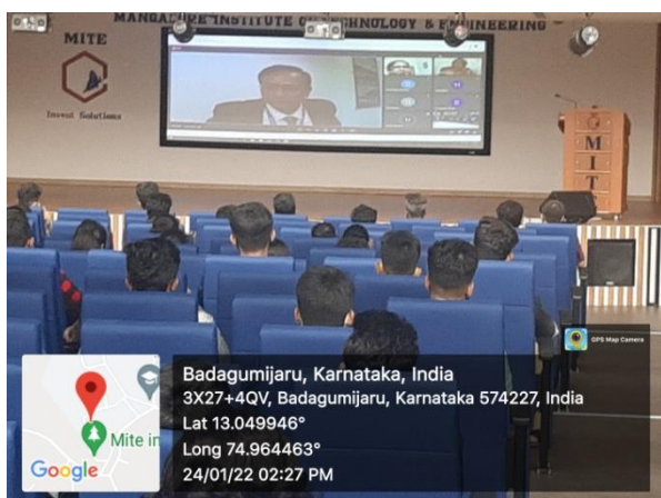
Principal addressing the gathering

She also indicated that the world is changing rapidly and this change has opened doors for women to fully participate in social, economic and political life. The talk was attended by both faculty and students.