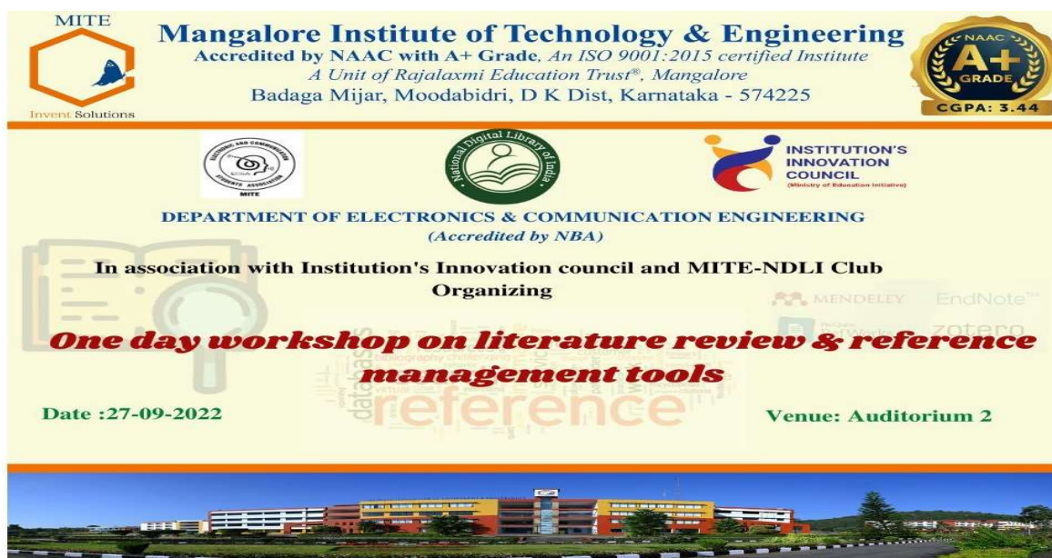
Poster of the Workshop

A one-day workshop on "literature review & reference management tools" is conducted for all the final year students by explaining various resources for the available literature and the reference management tools for writing journal papers and the project report; further, the student team had a practice session in the laboratory.