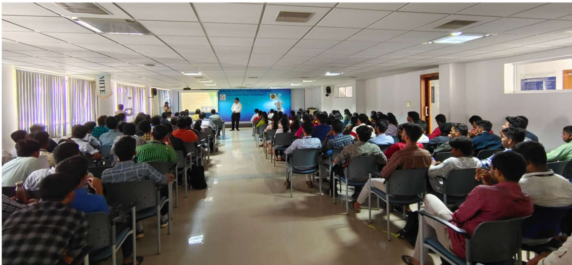
Young Entrepreneurs & students attended the workshop