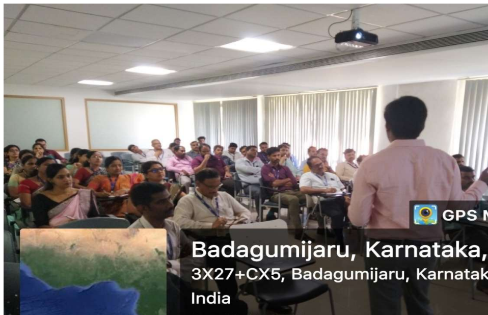
Faculty members receiving the presentation

A total of 113 faculty members attended the program, the program was concluded by collaborating and discussing best practices for plagiarism prevention, how faculty members can work together to promote academic integrity and ensure that students receive a quality education that values originality and critical thinking.