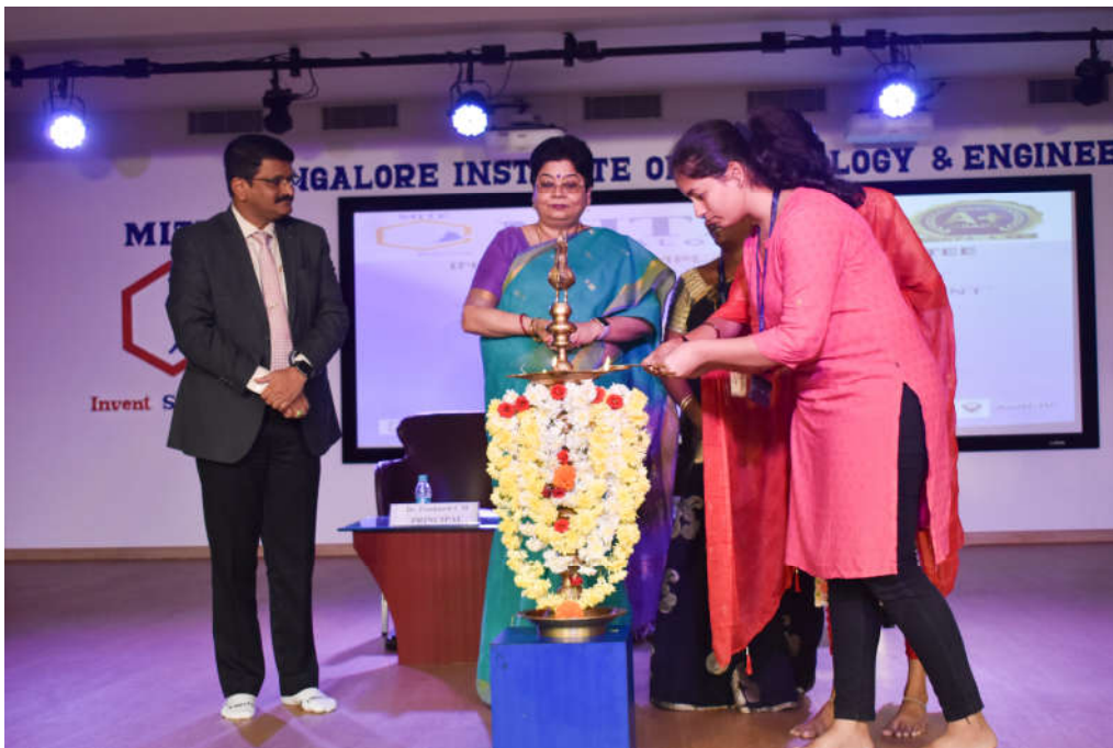
Fig.1 Inauguration through lighting the lamp

The celebration concluded with vote of thanks delivered by Ms. Pramila B. J and National anthem.