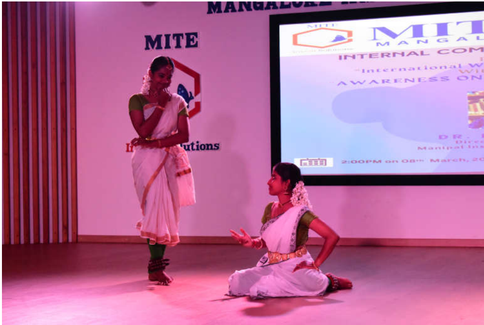
Fig.4 Cultural Event

Accredited by NAAC with A+ Grade & ISO 9001:2015 Certified Institution