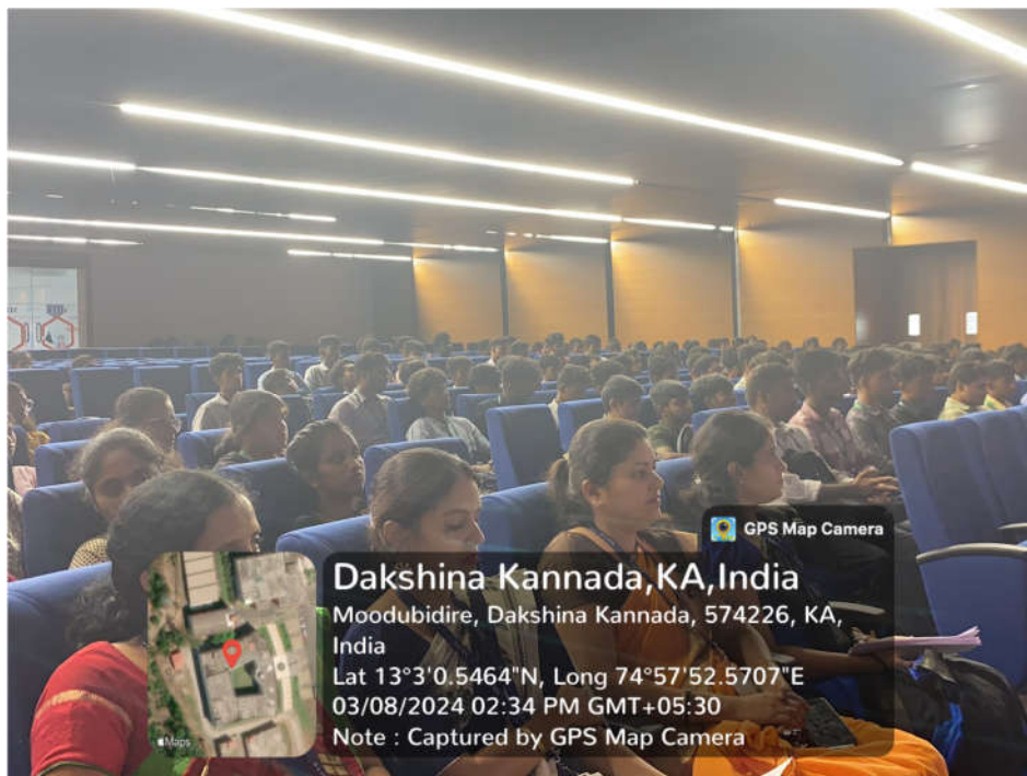
Fig.3 Audiences at the Venue